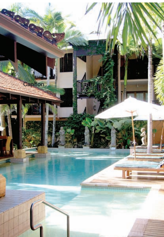
Hibiscus Gardens Spa Resort