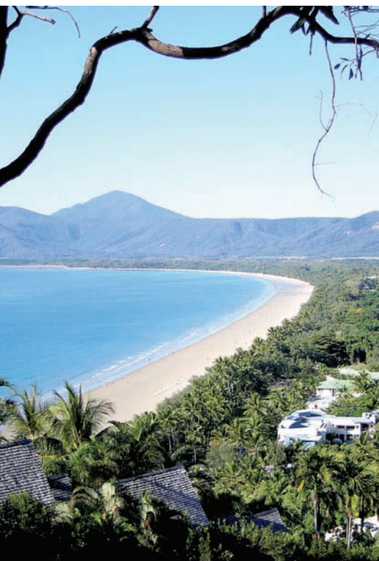
The view from Flagstaff Hill of Four Mile Beach